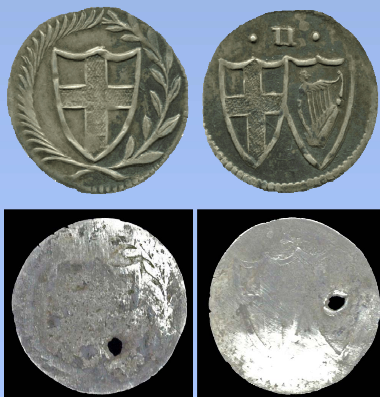
Above: Example of a Commonwealth era two-pence coin (front & back.) St. George's shield surrounded by wreath on obverse, conjoined shields of St. George & Ireland on reverse. Below: Smith's St. Leonard pierced silver coin (front & back) rotated so designs match those of coin example above.