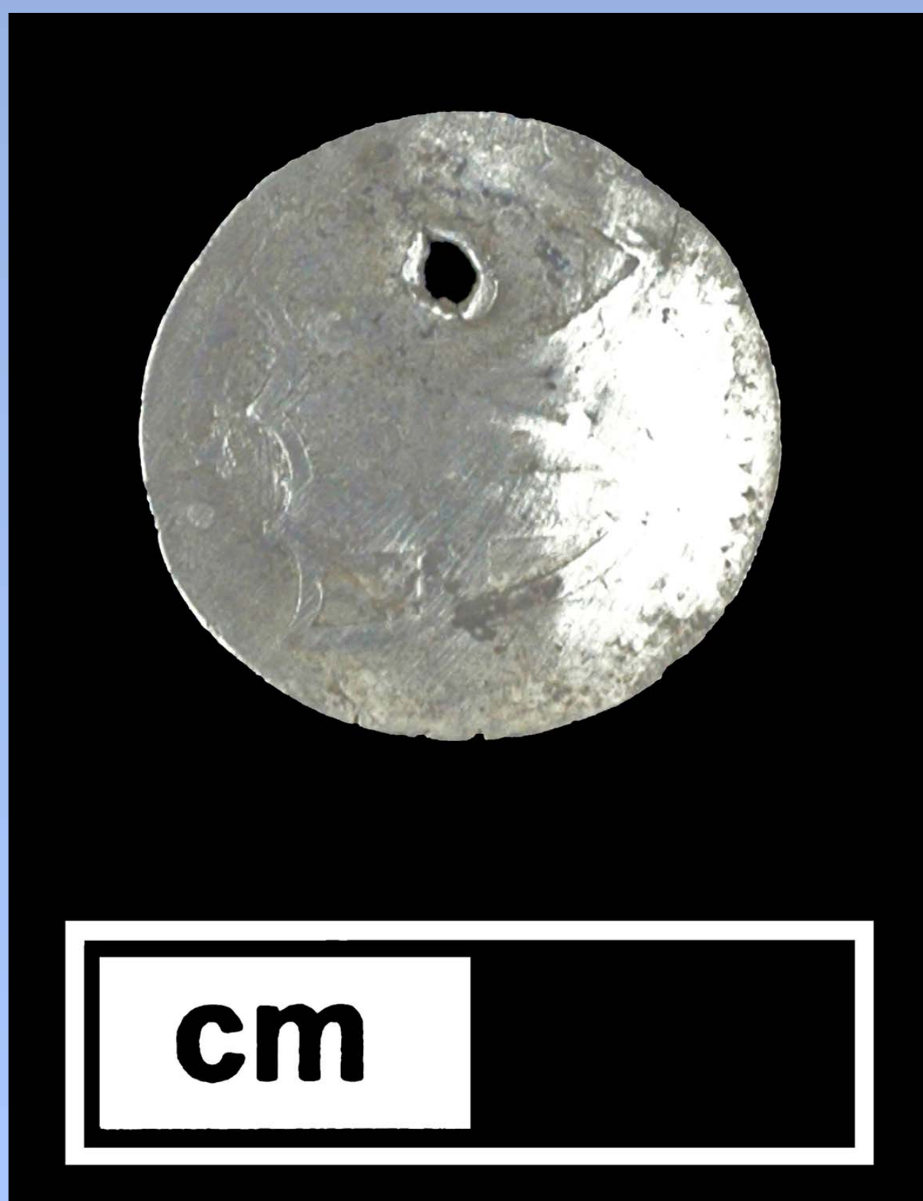
Smith's St. Leonard pierced silver coin back face, shows shields of St. George and Ireland with top of shields pointing to the left side of coin.